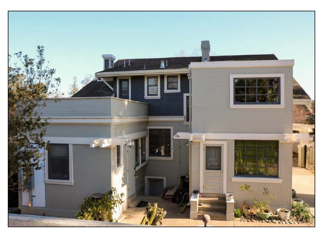
Figure 5: Rear (West) Facade