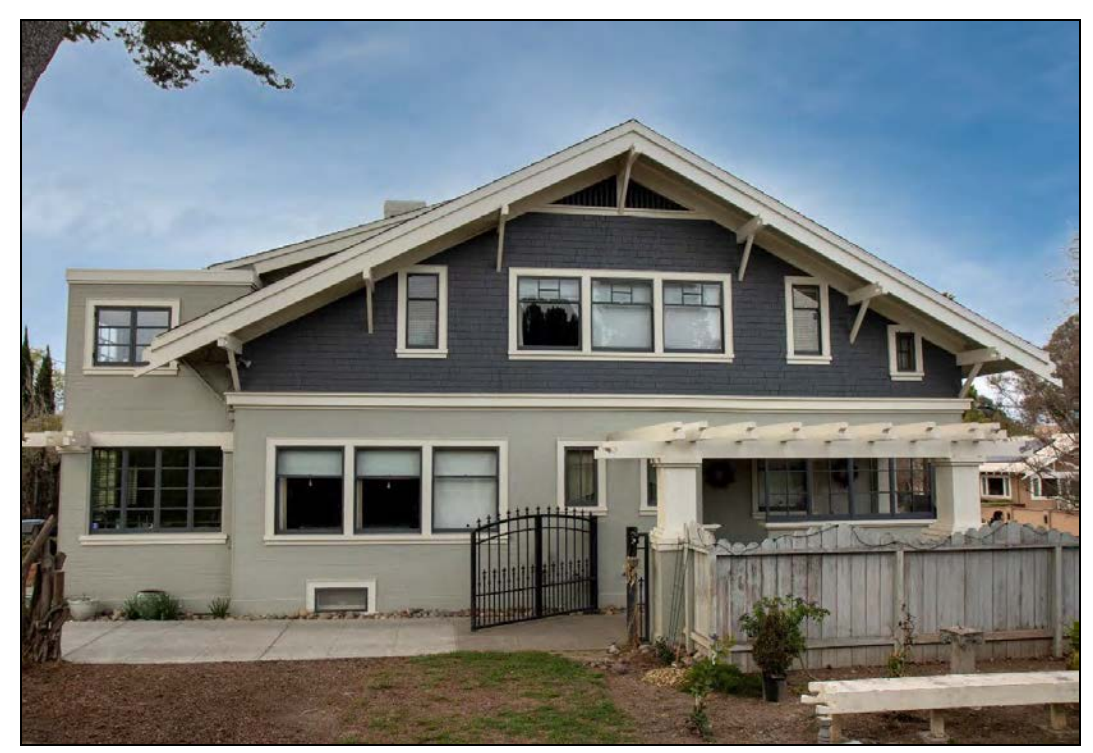
Figure 4: South Façade