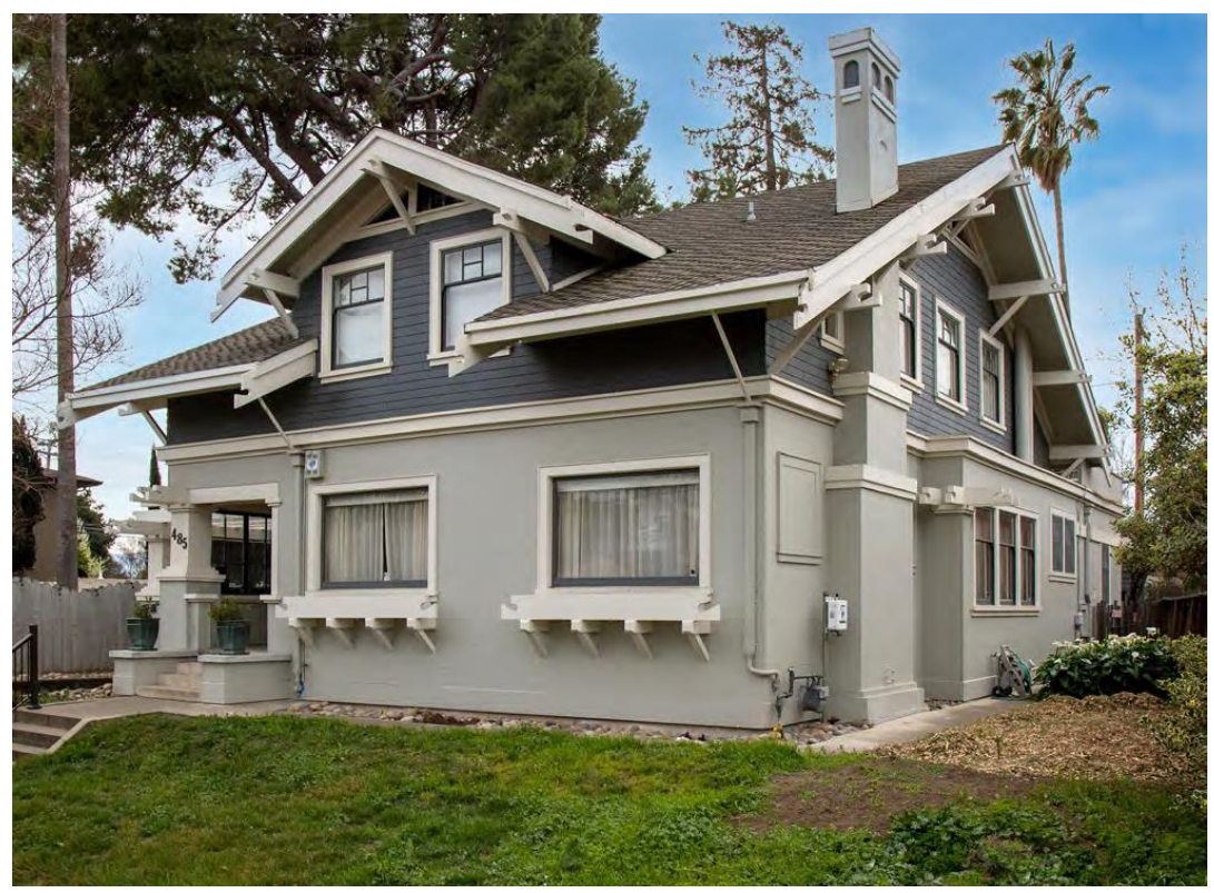
Figure 3: Northeast Façade