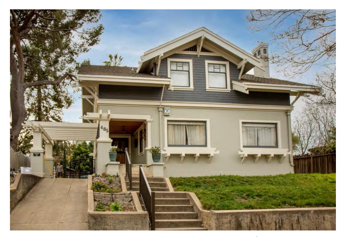
Figure 2: Front (East) Façade of 485 South 16th Street