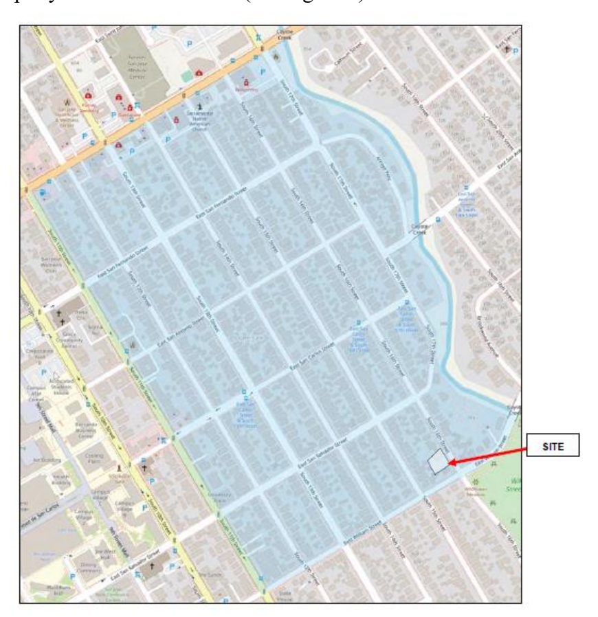
Figure 6: Site Location in Naglee Park Conservation Area

The house at 485 South 16<sup>th</sup> Street is located in the Naglee Park Conservation Area which is bounded by East Santa Clara Street on the north, South 11<sup>th</sup> Street on the west, Coyote Creek on the east, and East William Street on the south.South 16<sup>th</sup> Street runs from the north-west to southeast, so the property faces east-northeast (see Figure 6).