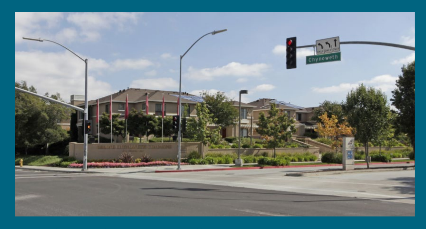
Ohlone Chynoweth – Affordable housing development located on a Light Rail Station