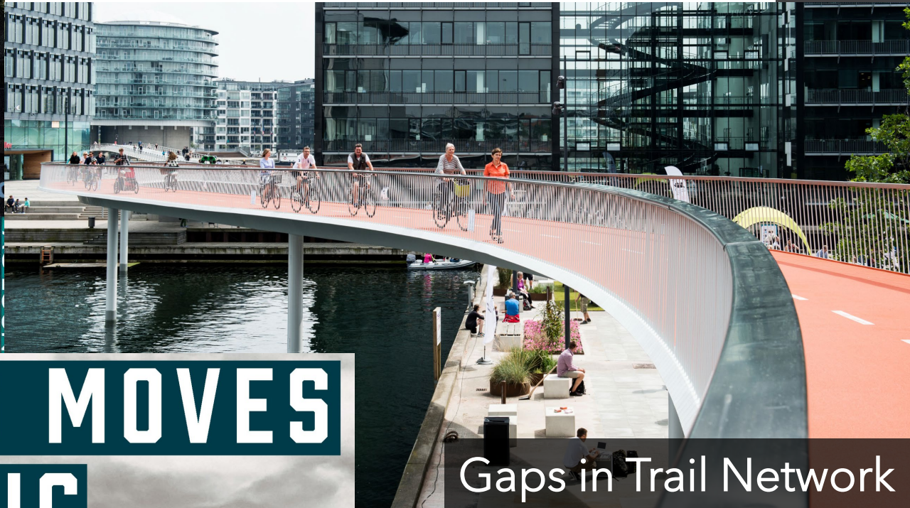
Gaps in Trail Network