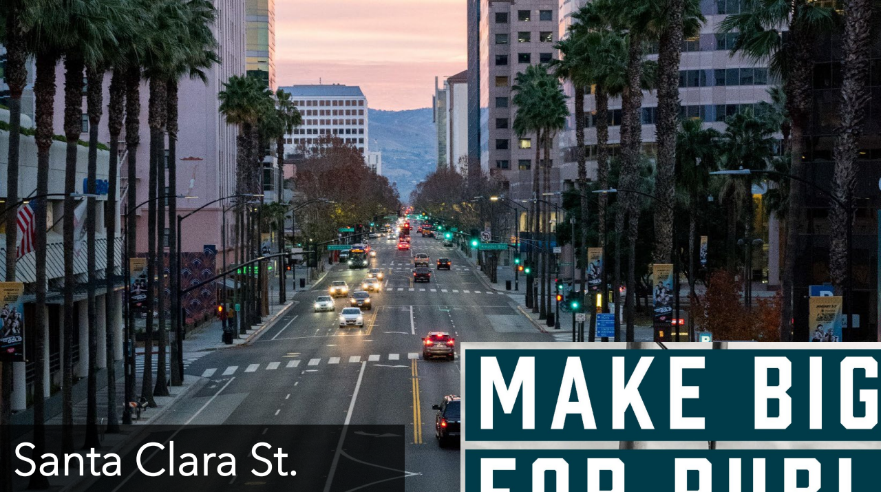
Santa Clara St.