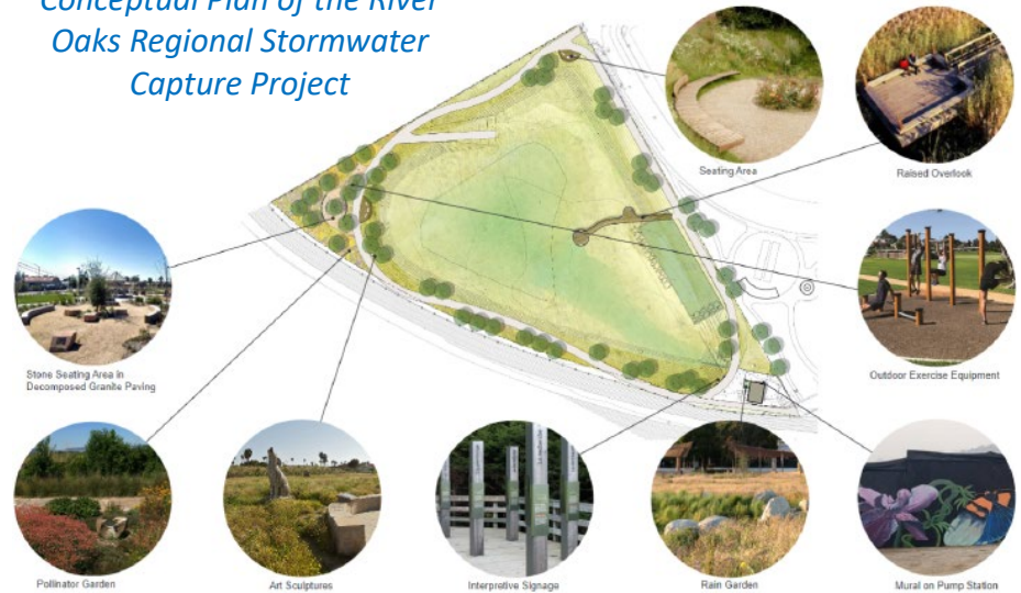
Conceptual Plan of the River Oaks Regional Stormwater Capture Project