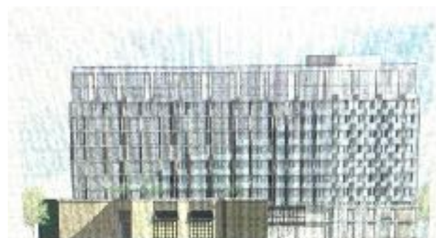
North Elevation -- Building 3