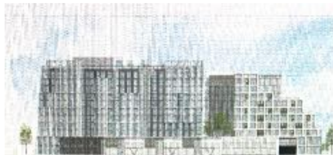
West Elevation — Building 1