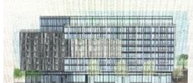
Saratoga Elevation -- Building 4B