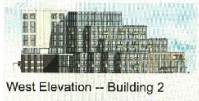
West Elevation -- Building 2