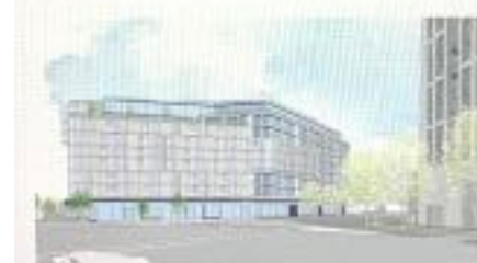
Architectural Presence at Major Street Intersection