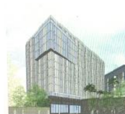
Affordable Residential Tower w/Entry Court