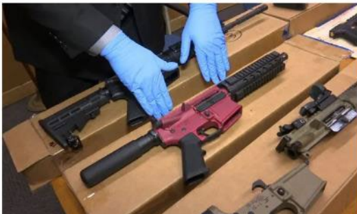
Ghost guns at the San Francisco police department.

Concern grows as guns appear in homicides, school shootings and domestic terror incidents