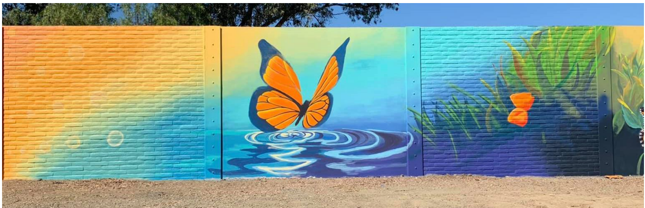
Photo 3: Close-up view of butterfly “wing” backdrop for adults looking west from the corner of Havana Drive and Midfield Avenue.