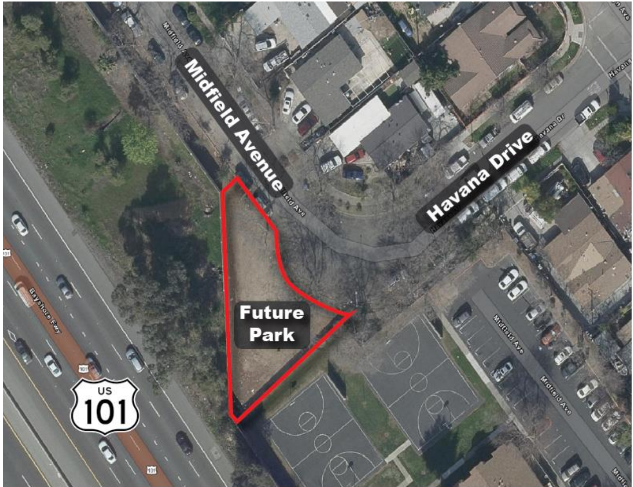
Figure 1: Site Location Map.