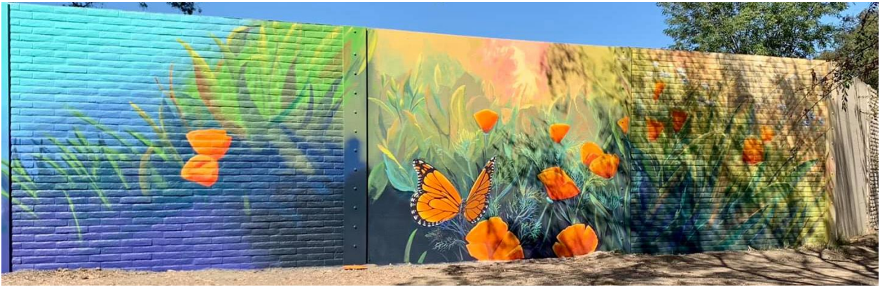
Photo 4: Close-up view of butterfly “wing” backdrop for children looking west from the corner of Havana Drive and Midfield Avenue.