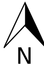
Figure 2: Regional Location Map.