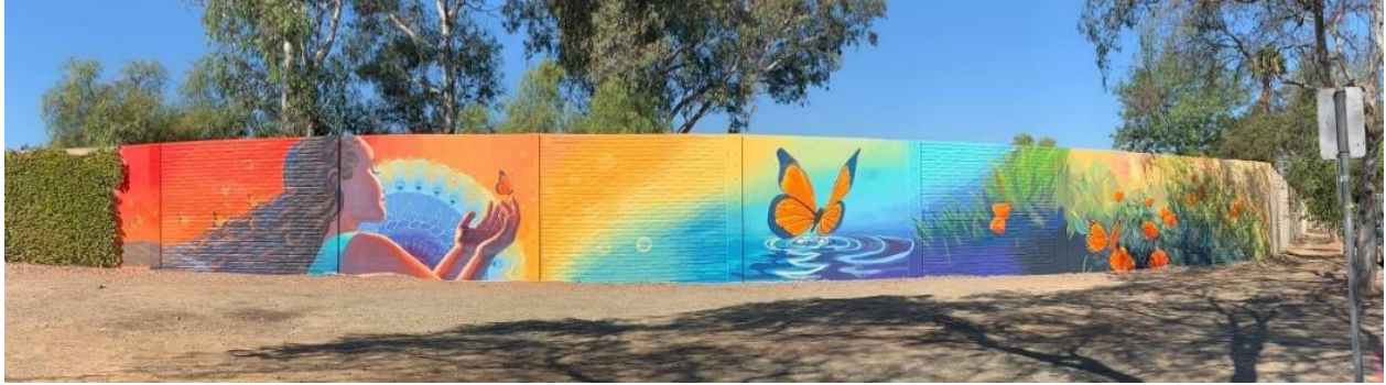
Photo 1: View of full mural looking west from the corner of Havana Drive and Midfield Avenue.

The mural is titled “El Sueño de la Mariposa” (The Dream of the Butterfly) and was completed in September 2021 by muralist Morgan Bricca.