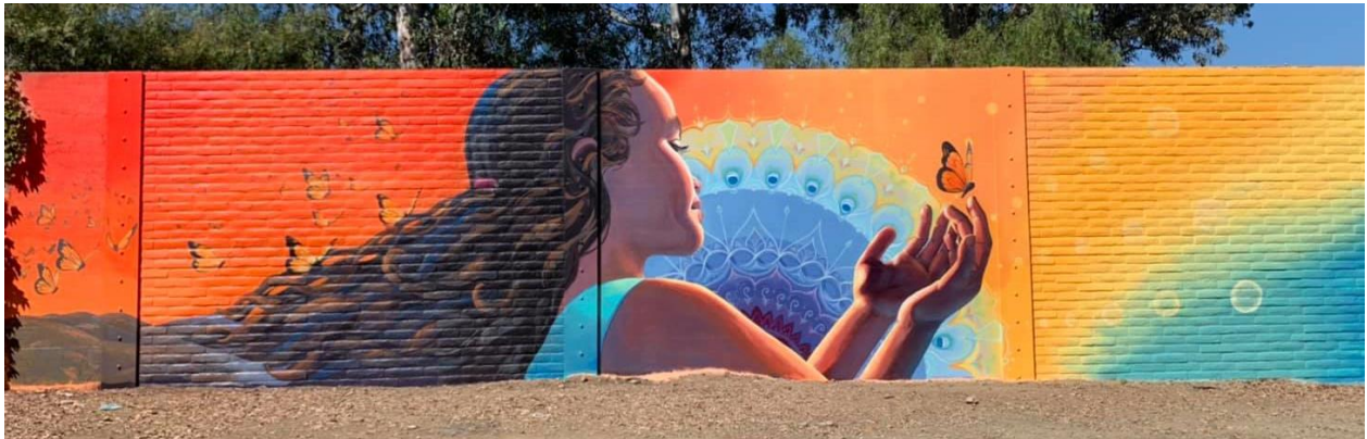
Photo 2: Close-up view of young child with butterflies looking west from the corner of Havana Drive and Midfield Avenue.