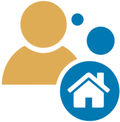
Need for Housing