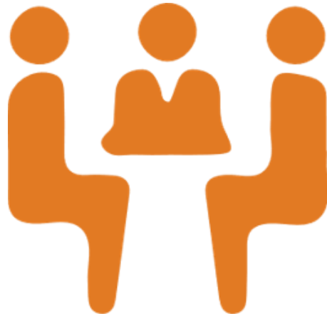
Willingness to Partner