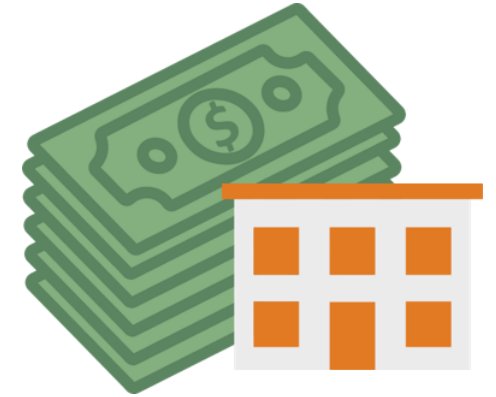
Ability to Pay