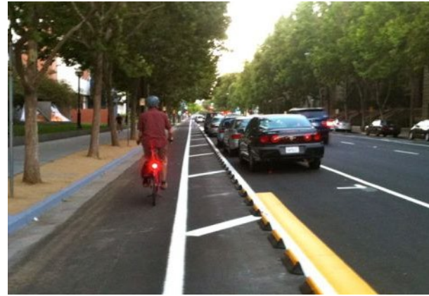
Class IV – Protected Bike Lane (S. 4 th Street)

Implementation practices should continue the success of previous years' bikeways program efforts, most notably: