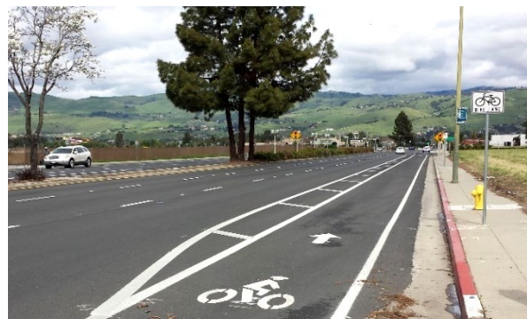
Class II - Bike Lane (Tully Road)