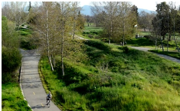
Class I - Off-Street Trail (Guadalupe River Trail)

Bike facilities in Better Bike Plan 2025 include the following, with an emphasis on bike boulevards and protected bike lanes: