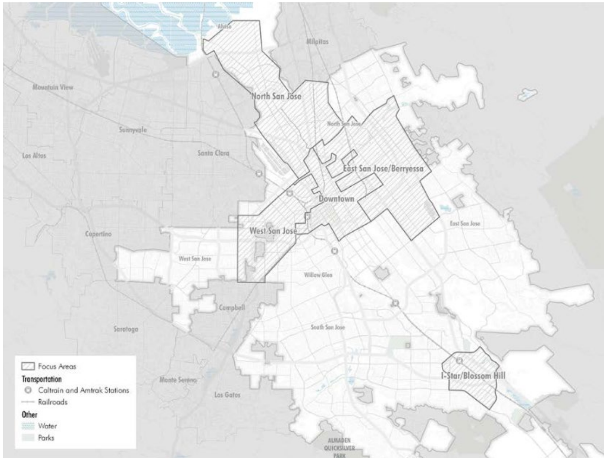
Bike Plan 2025 focus areas.

José; Downtown; and the Edenvale/I-Star development area in South San José. These focus areas combined with a quick-build implementation strategy will help ensure significant build-out of Better Bike Plan 2025 .