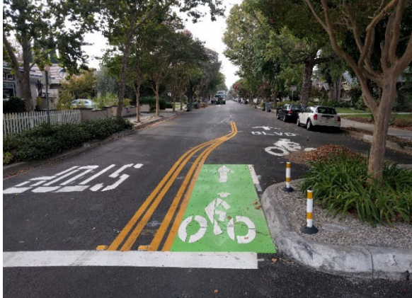
Class III – Bike Boulevard (S. 16 th Street)