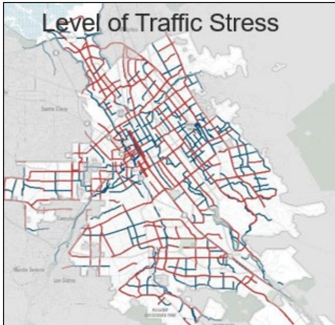
Level of Traffic Stress in San José

bicycle use are often cut-off by freeways, expressways, and arterials, bicycling as a mode of transportation is not practical for many residents of San José who may not feel comfortable among existing conditions. Select analysis completed by Toole Design Group for existing conditions is shown in the following images: