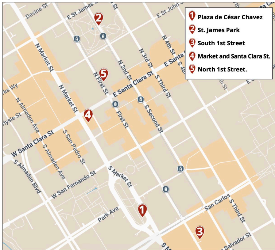
APT Locations in Downtown San José

Under the current agreement expiring June 30, 2026, JCDecaux is responsible for cleaning, maintaining, repairing, and operating the APTs, including graffiti removal, daily inspections, maintenance reporting, and ensuring the facilities remain operational 24 hours per day.