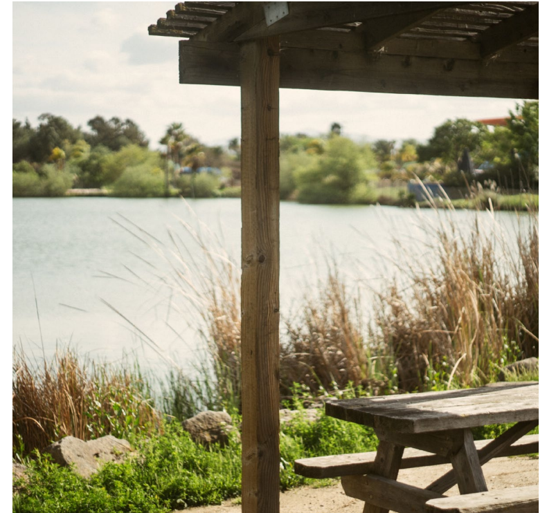
Lake Cunningham, Charter Parkland