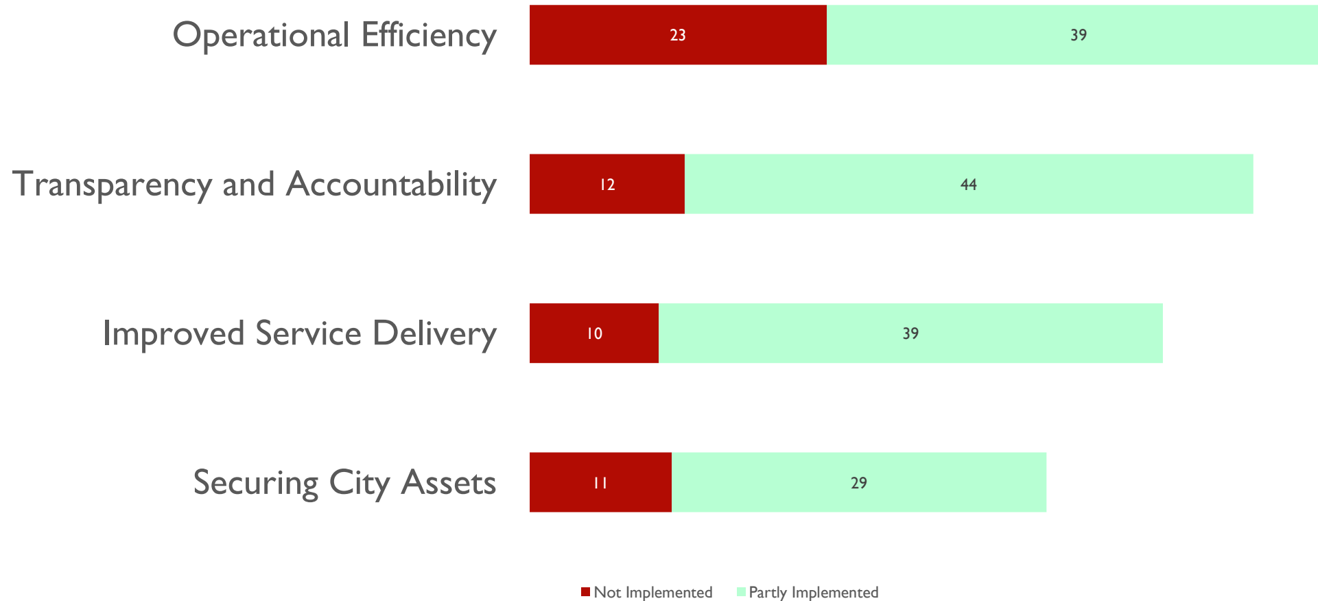
Open Audit Recommendations by Intended Outcome