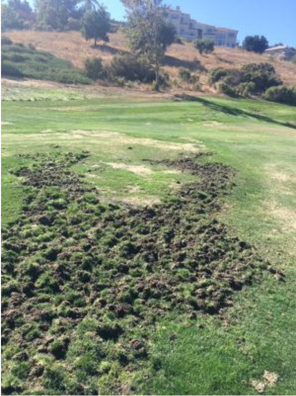
New damage surrounding previously damaged area

THE FOLLOWING PHOTOS ARE FROM THE FIRST 2 WEEKS IN OCTOBER