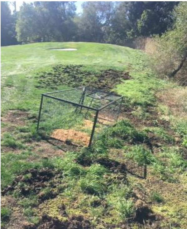
Trap 1-Damage directly around the trap, with no bait eaten in trap.