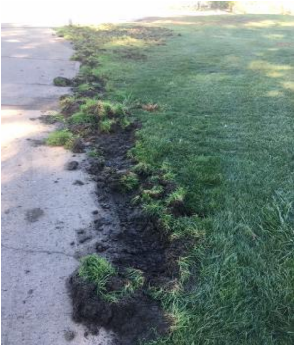
Damage from 10/22.