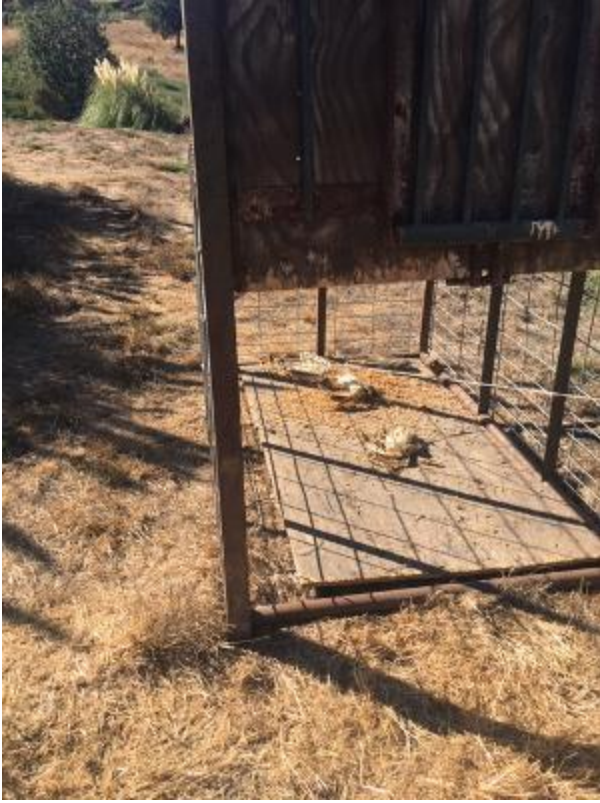
Trap 2-Bait eaten around trap, no activity inside