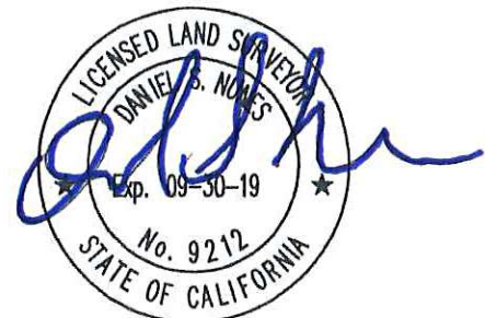
EXHIBIT "A" Page 1 of 1

Thence, along a curve with a radius of 553.00 feet deflecting to the right through an angle of 00°58'37" and arc distance of 9.43 feet to the Point of Beginning and containing 87,107 square feet, (1.9997 acres), more or less.