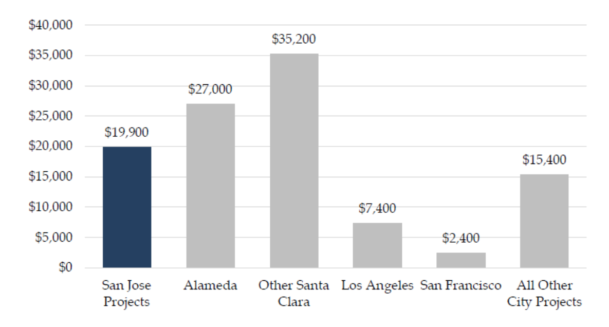
Chart 3: Impact Fees/Unit

A current work item in the Housing Crisis Work Plan is to assess reducing the construction taxes charged to affordable housing developments. Staff initiated internal discussions around this item, but due to staffing changes in the Housing Catalyst role, this work has been put on hold. As part of this work effort, staff will seek to understand how San José construction taxes compare to other jurisdictions.