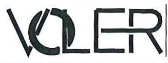
EXHIBIT B PAGE 1 OF 1

PLAT OF DESCRIPTION APN 244-16-020, PARCEL 56 423 M 39-41 2222 TRADE ZONE BOULEVARD IN THE CITY OF SAN JOSE, CALIFORNIA