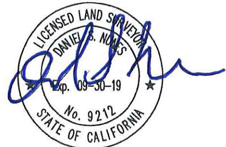
EXHIBIT "A" Page 1 of 1

Thence, along a curve with a radius of 553.00 feet deflecting to the right through an angle of 00°58'37" and arc distance of 9.43 feet to the Point of Beginning and containing 87,107 square feet, (1.9997 acres), more or less.