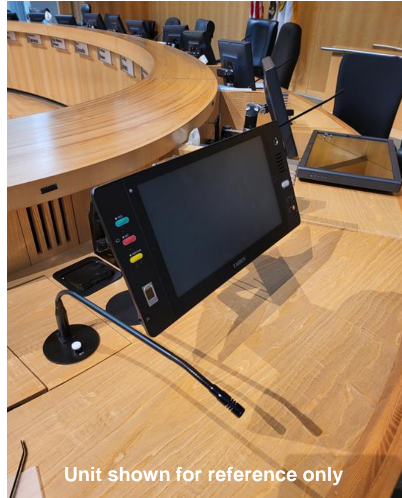
Unit shown for reference only