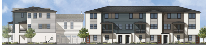
Building A Duplex (Right Elevation) Historic Graves House (Beyond) (South Elevation) Building B 6-Plex (Front Elevation)