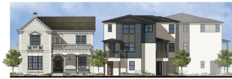
Historic Graves House (West Elevation) Building A Duplex (Front Elevation) Building B 6-Plex (Left Elevation)