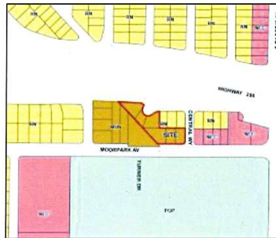
Figure 3: Proposed General Plan Land Use Designation