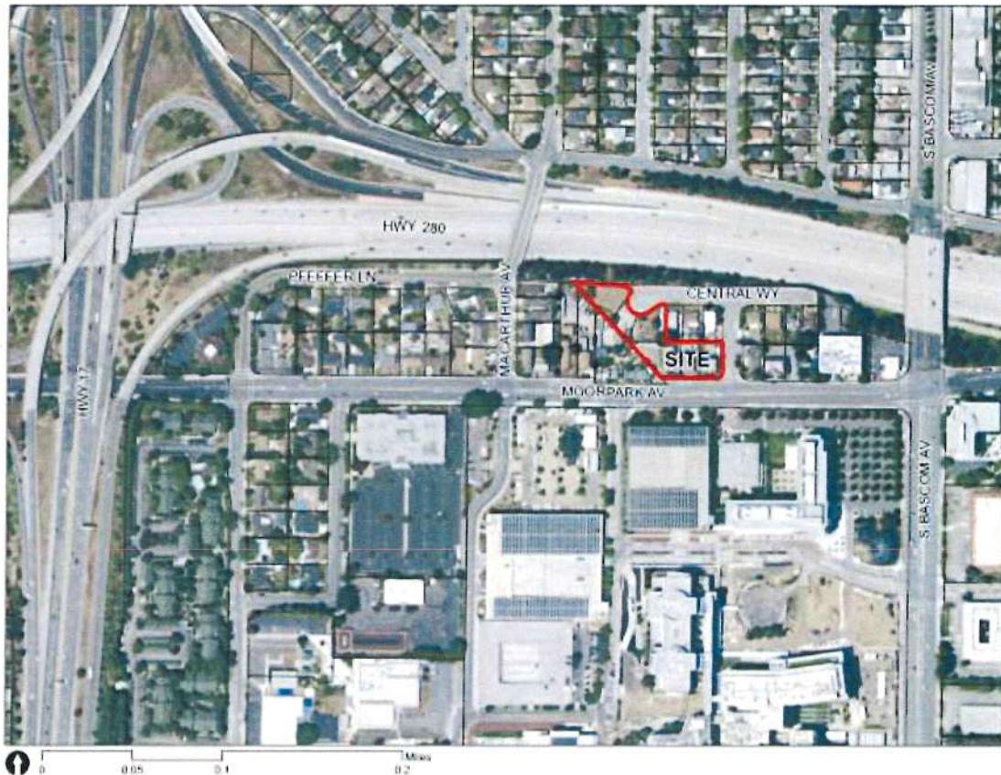
Figure 4. Neighborhood Context

While the subject site is not within a General Plan Growth Area, residential densities of nearby properties vary. The site and its surrounding parcels are bounded between Highway 280, Highway 880/State Route 17, S. Bascom Avenue, and Santa Clara Valley Medical Center (see Figure 4). Given the location and existing variation in type and density of residential development on the site and surrounding properties as discussed above, the proposed Mixed Use Neighborhood land use designation is appropriate for the site.