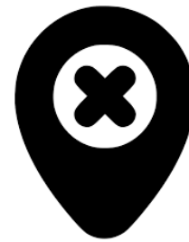
Access to opportunity