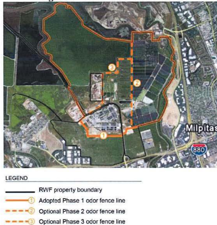
Figure 2 – RWF Odor Fence Lines

TREATMENT PLANT ADVISORY COMMITTEE September 3, 2019 Subject: Update on Biosolids Disposition Options Page 4