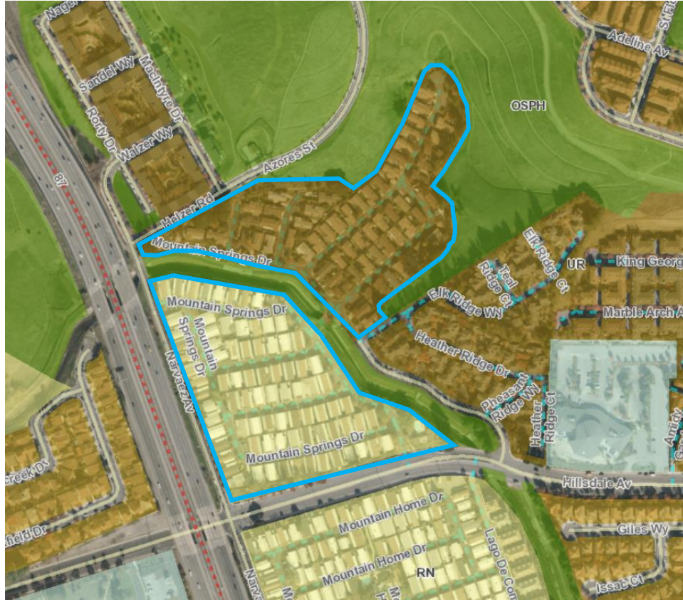
Mountain Springs Mobilehome Park: Residential Neighborhood & Urban Residential to Mobilehome Park