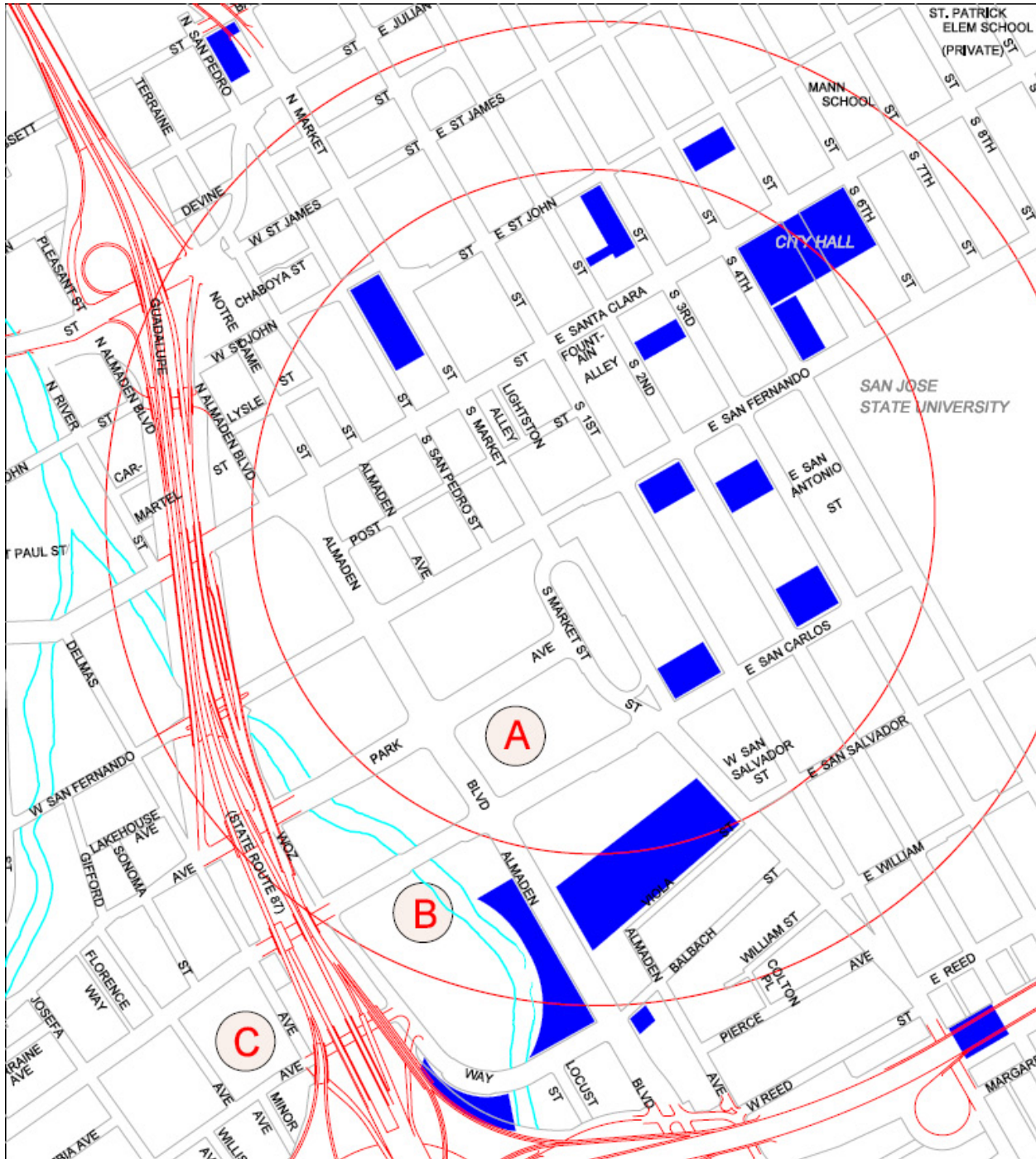
EXHIBIT III – PARKING RATE ZONES