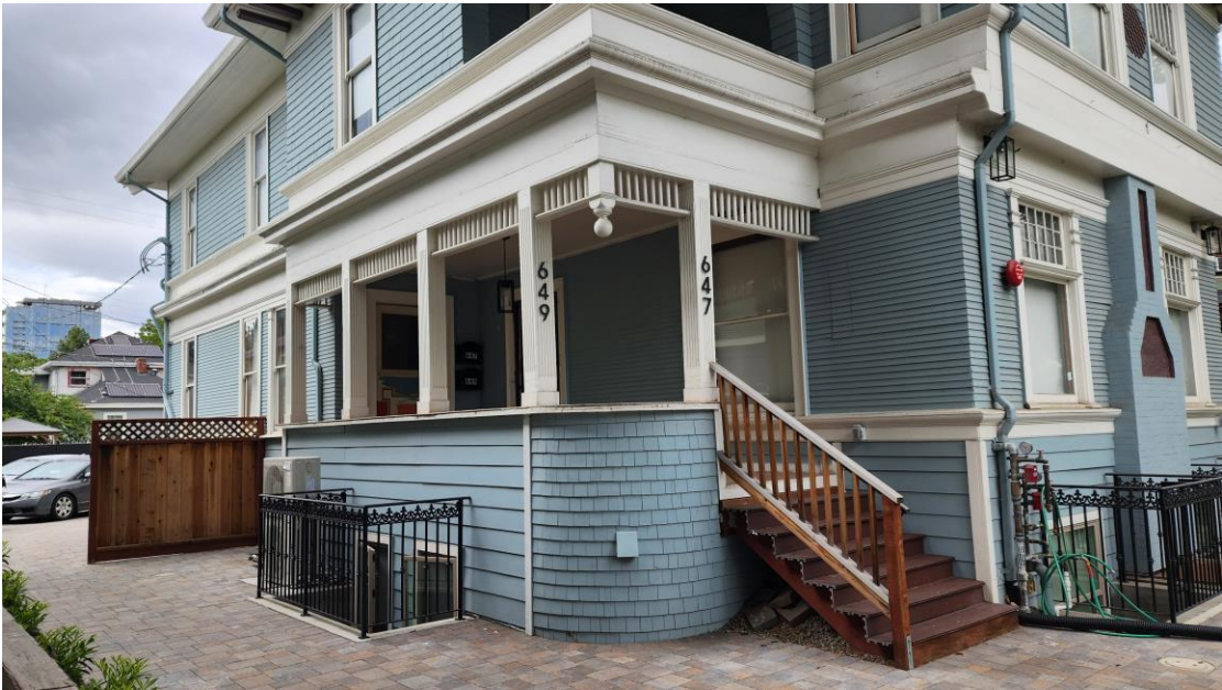
Figure 4: Southeast Elevation.