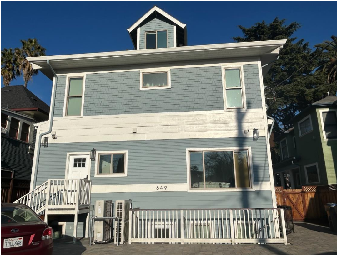
Figure 6: Rear (West) Elevation

On December 9, 2025, the property owner, William Wang, submitted applications to designate the house at 647 South 6 th Street as a City Landmark and to enter into a Historical Property (Mills Act) Contract to restore, rehabilitate, and maintain the property for a minimum of 10 years.