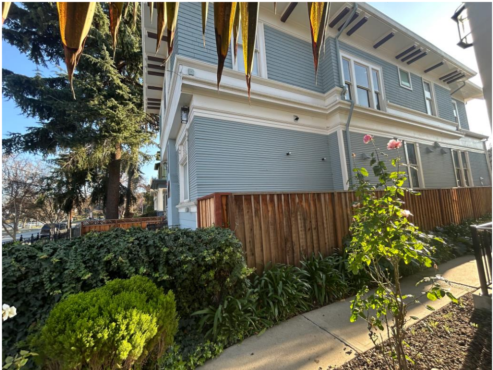
Figure 5: North Elevation