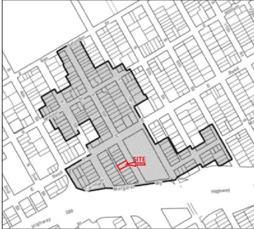
Figure 2: Map of Reed City Landmark District