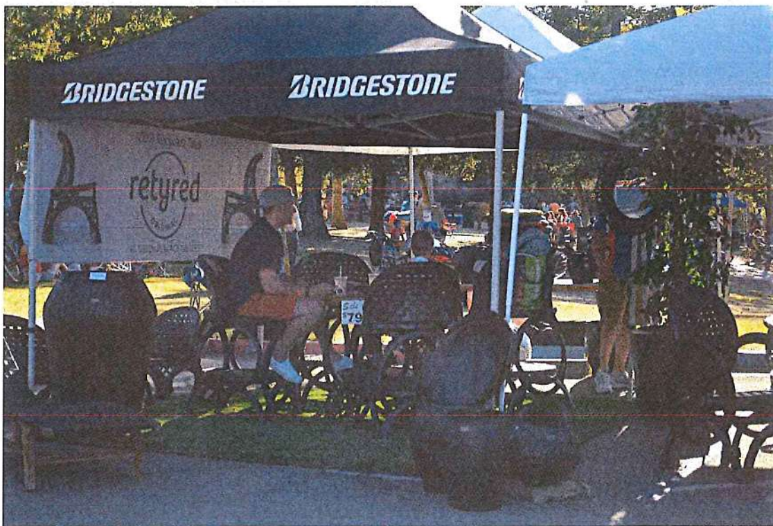
Major Sponsor Skip's Tires showcasing recycled tires as furniture under the trade name "ReTyred"

After a short breather, we'll quickly be back to planning the 5th Annual July 4th Family Fun Festival & Fireworks Show . We look forward to seeing you again next year!