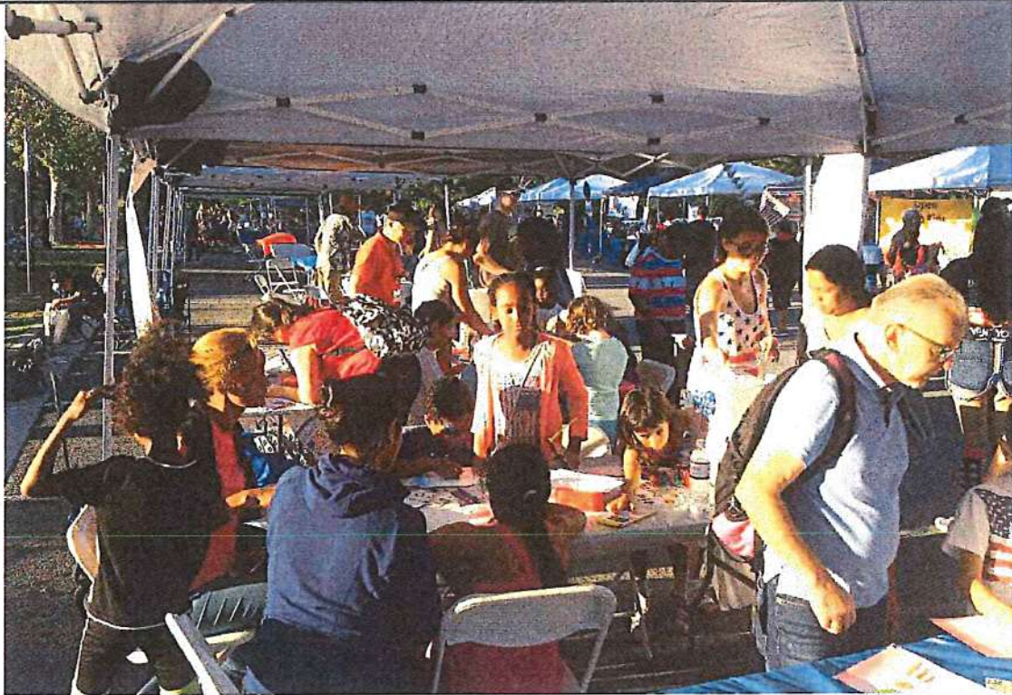
Letters to the Soldiers Booth