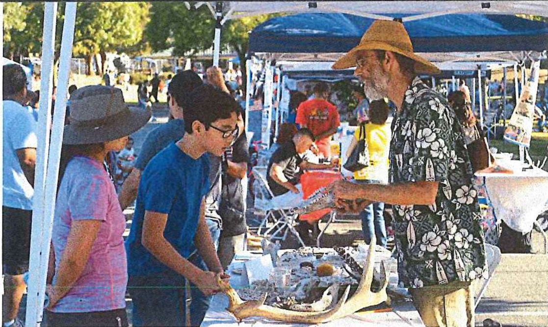
Santa Teresa Foothills Neighborhood Association (STFNA) showcasing local fauna