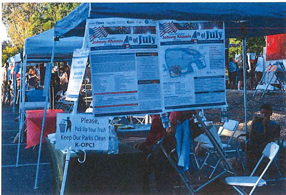
Program signage and clean up reminders