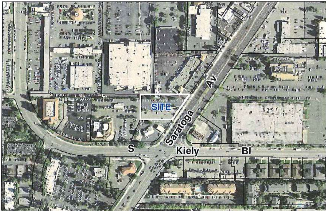
Figure 1: Aerial image of the subject site