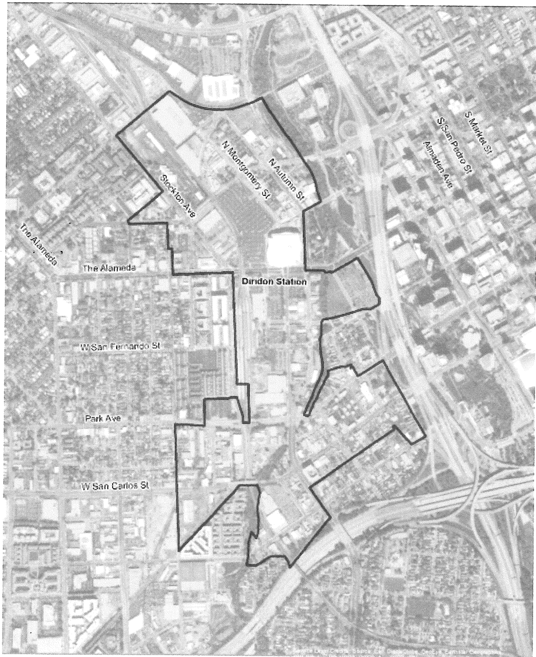
□ Corrected Impact Fee Zone Boundary