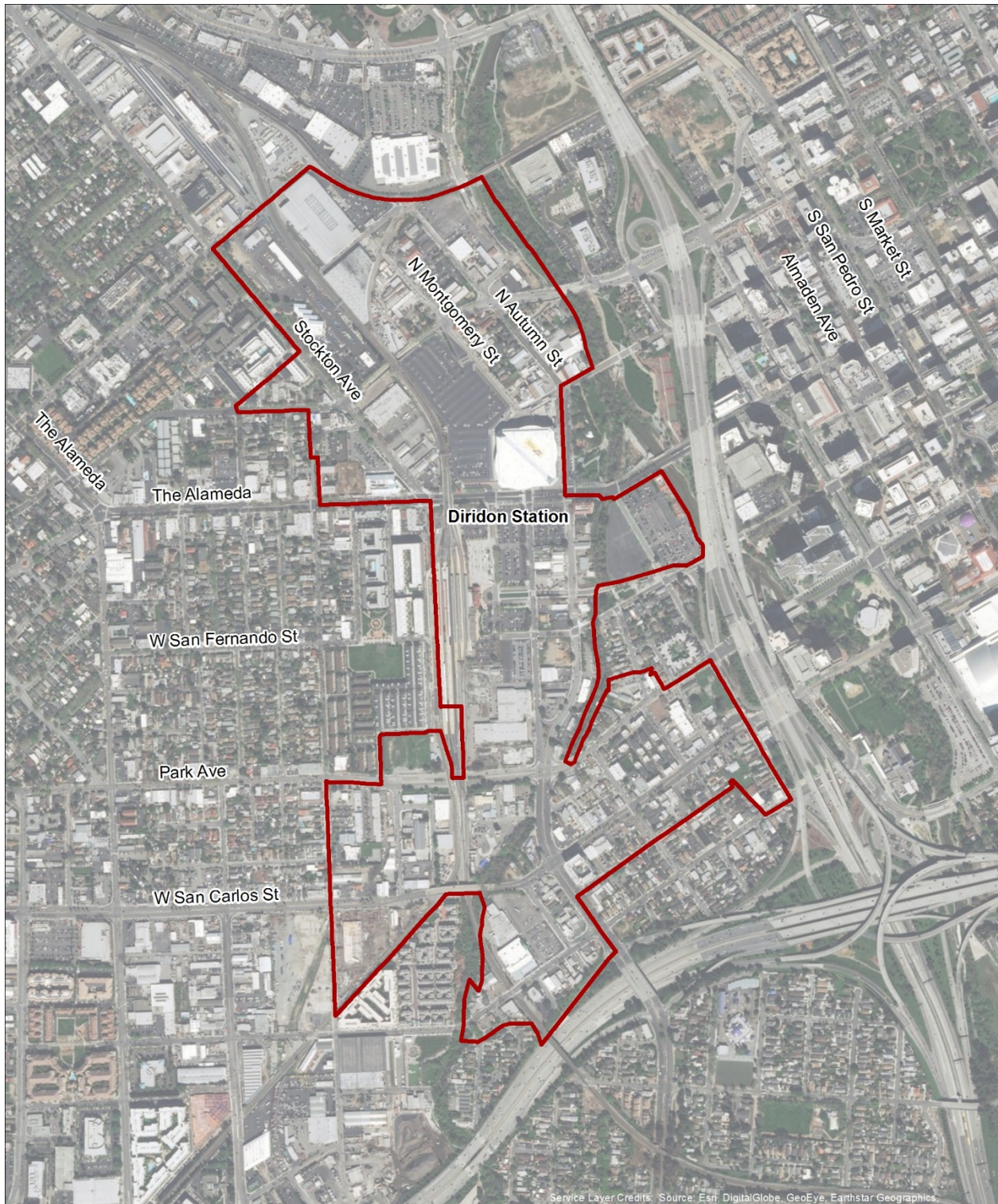
FIGURE 5: DIRIDON STATION AREA IMPACT FEE ZONE