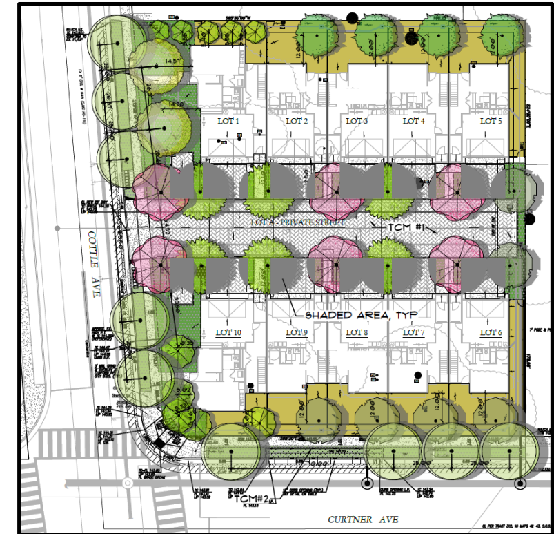
Curtner Avenue Residential Project Site Plan