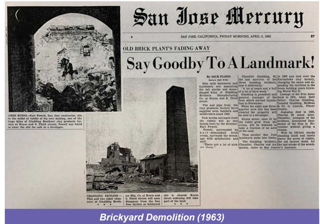
Brickyard Demolition (1963)