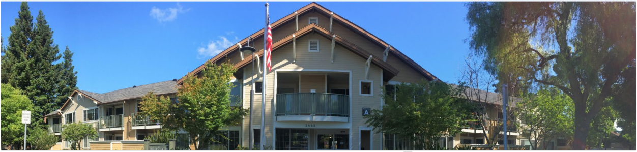
Bracher Gardens Apartments

In 1967, the Santa Clara County Board of Supervisors established the Santa Clara County Housing Authority (SCCHA). SCCHA has an agreement with the City of San José to administer and manage the Housing Authority of the City of San José (HACSJ)'s Housing Choice Voucher program. This MTW Plan presents a consolidated strategy to be implemented for both the County and City programs.