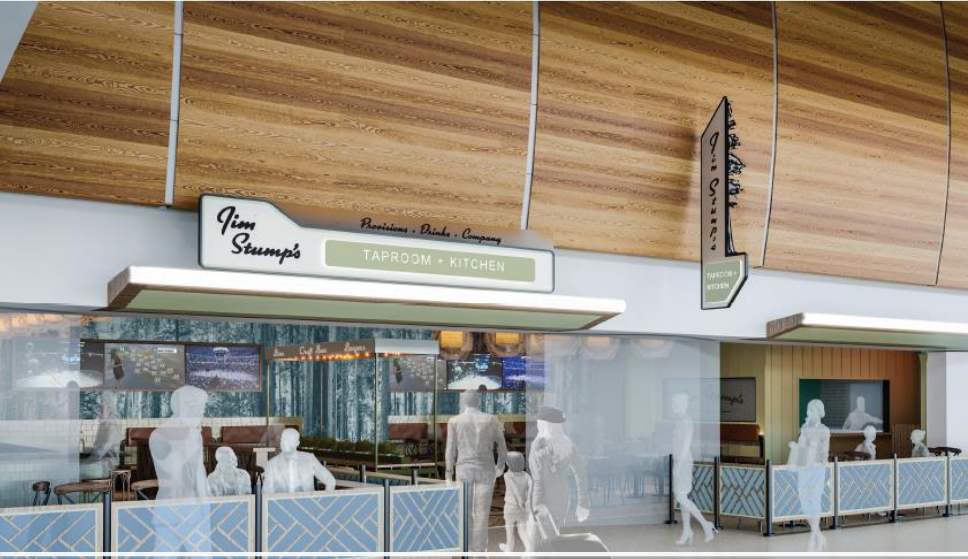
Package I SSP America Terminal B: Jim Stump's Taproom + Kitchen