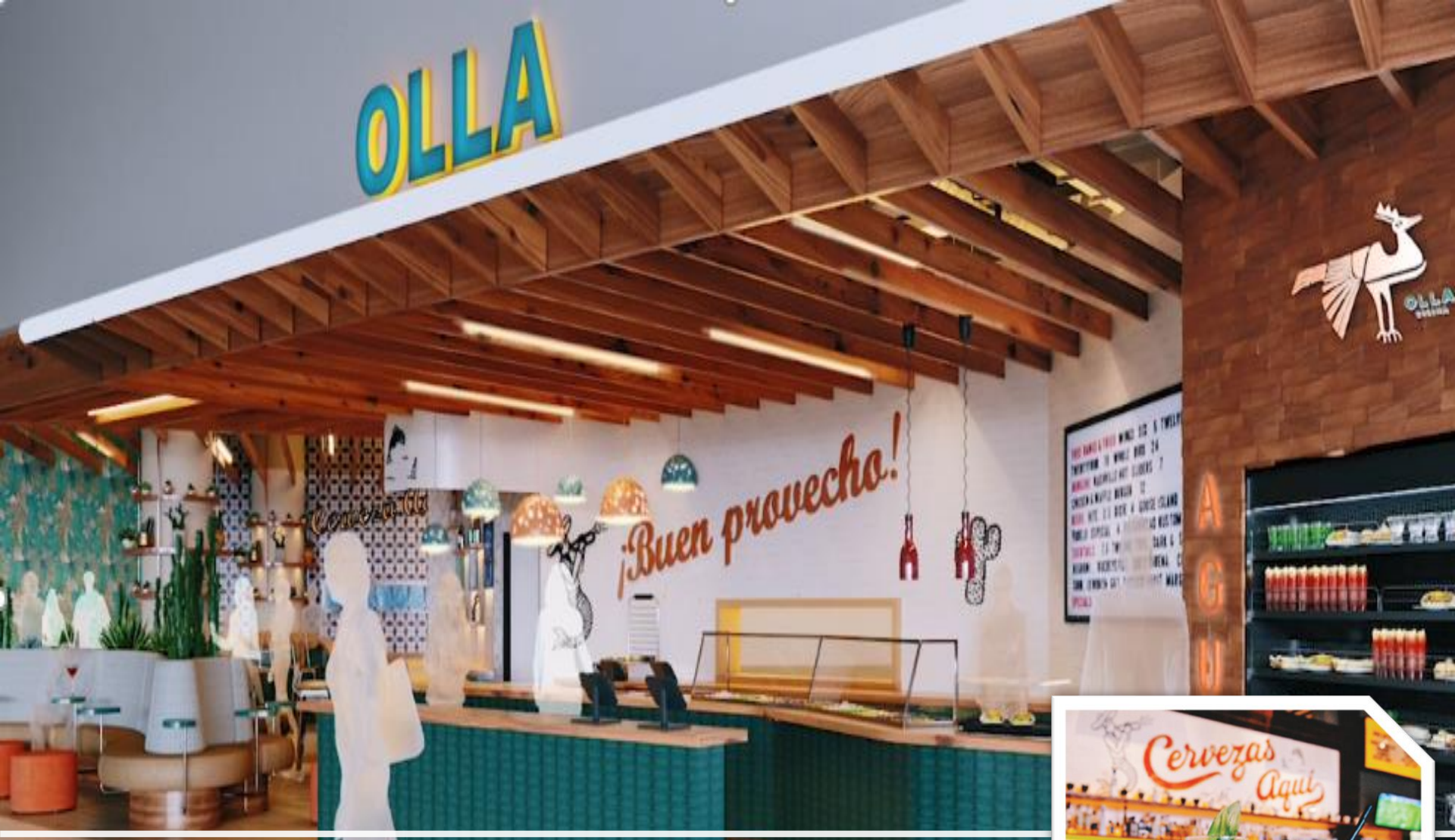
Package I SSP America: Concepts Terminal A: Olla Cocina