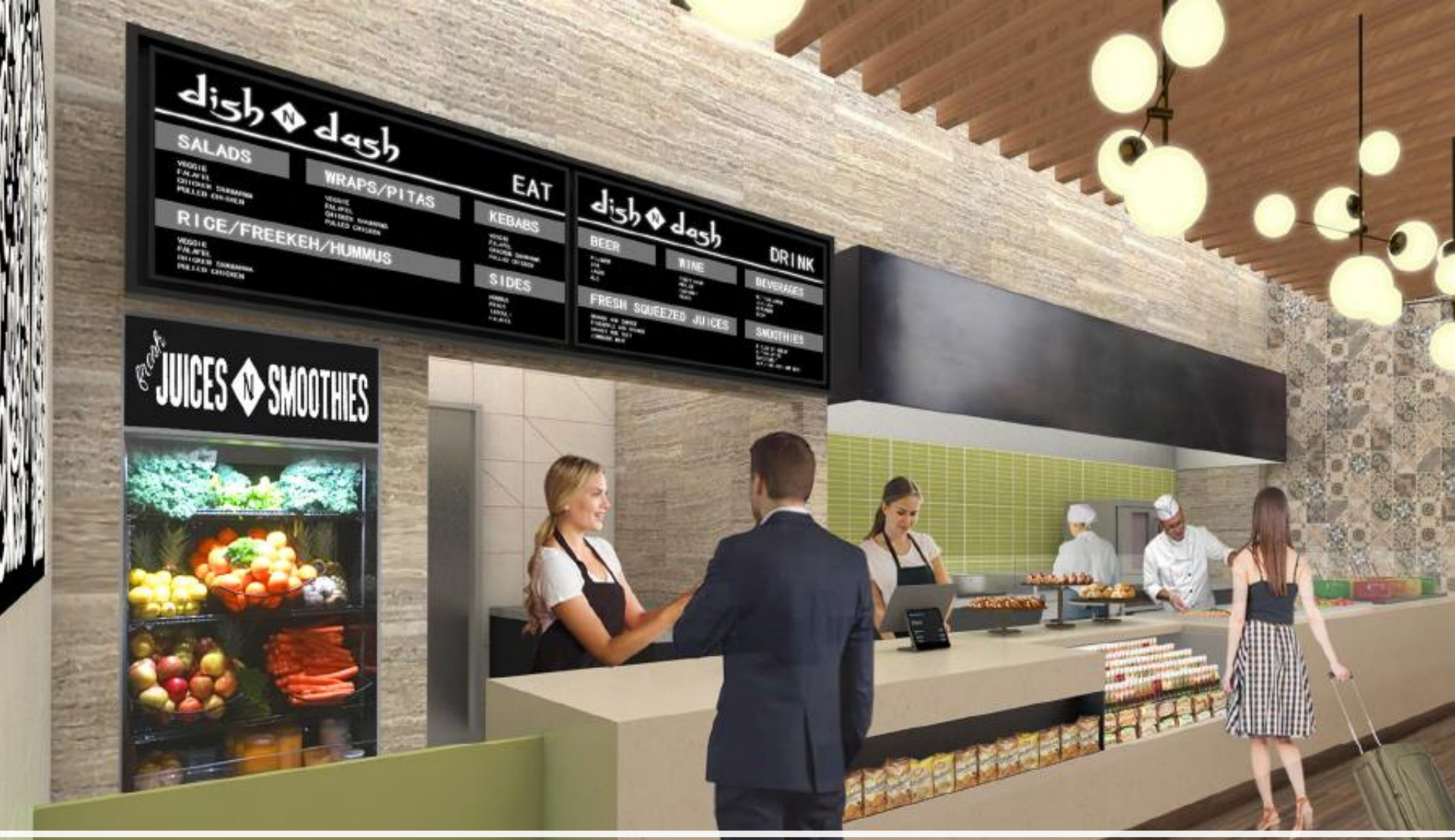
Package III WSE Group Terminal B: Dish n Dash