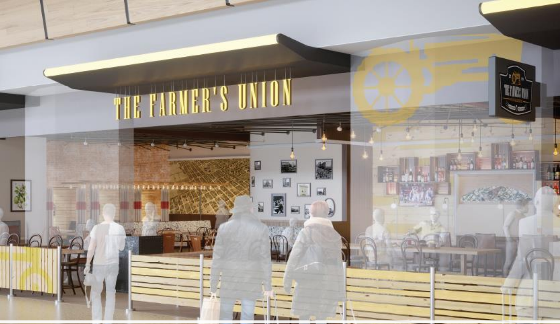
Package I SSP America Terminal B: The Farmer's Union