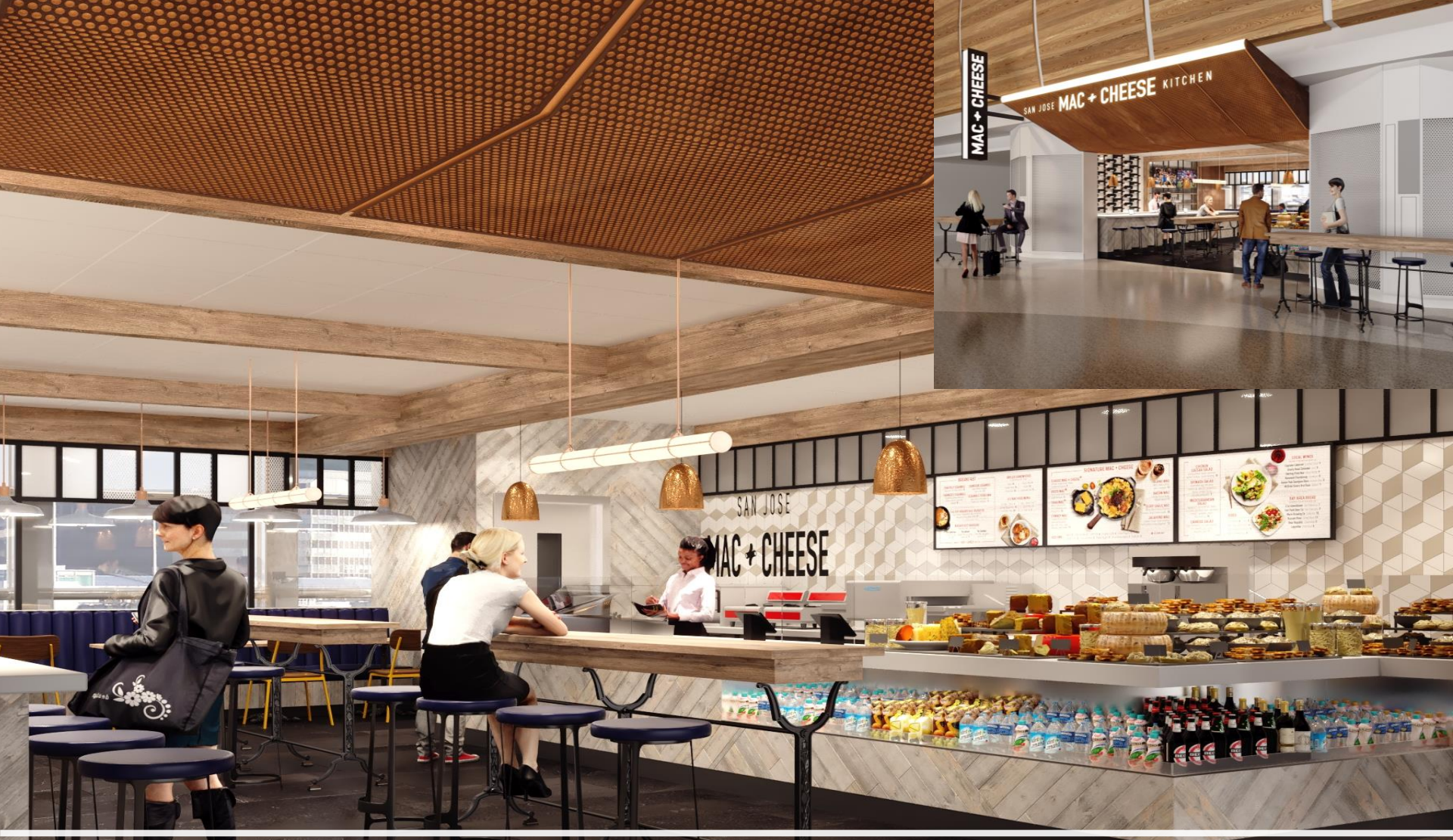
Package II Elevate Gourmet Terminal B: San Jose Mac+Cheese Kitchen