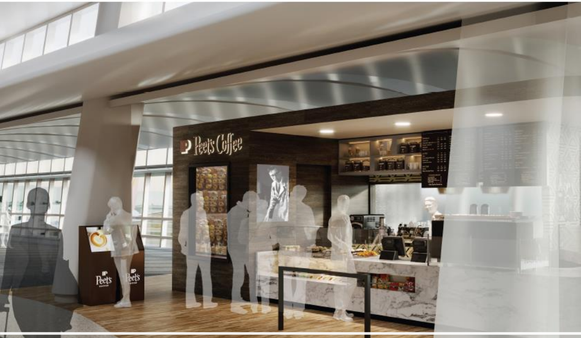
Package I SSP America Terminal B: Peet's Coffee