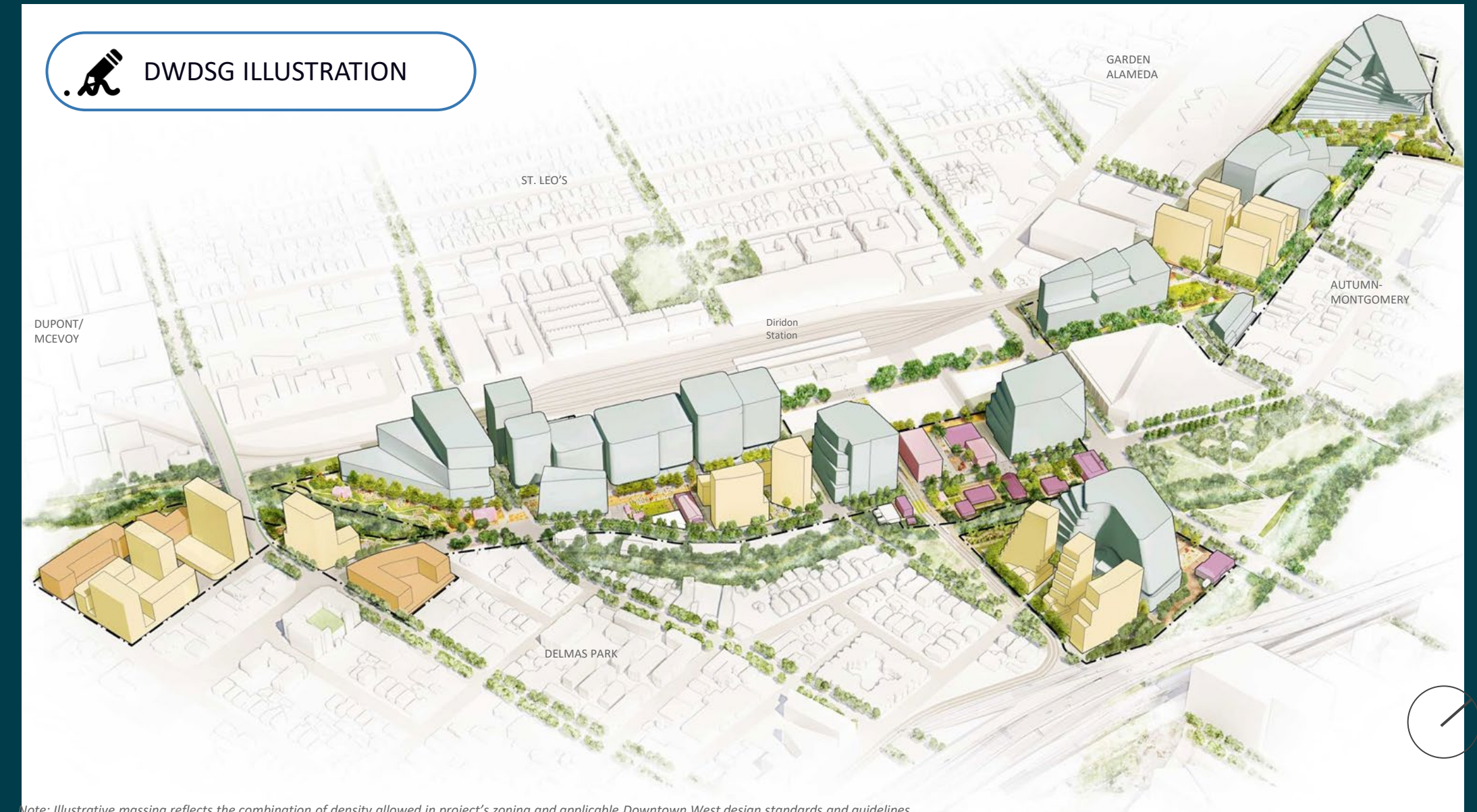
Note: Illustrative massing reflects the combination of density allowed in project's zoning and applicable Downtown West design standards and guidelines.