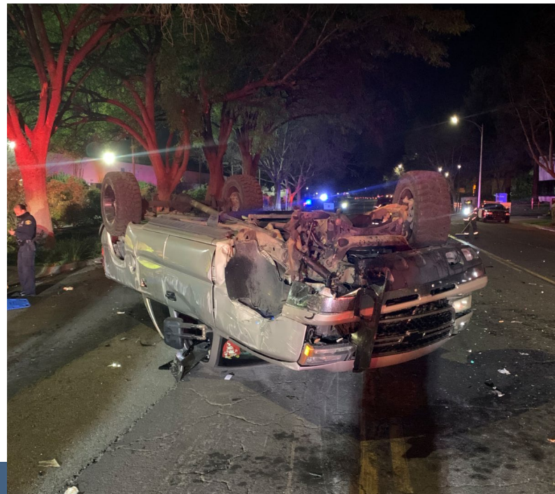
Photo from Sideshow/street race on March 12, 2021