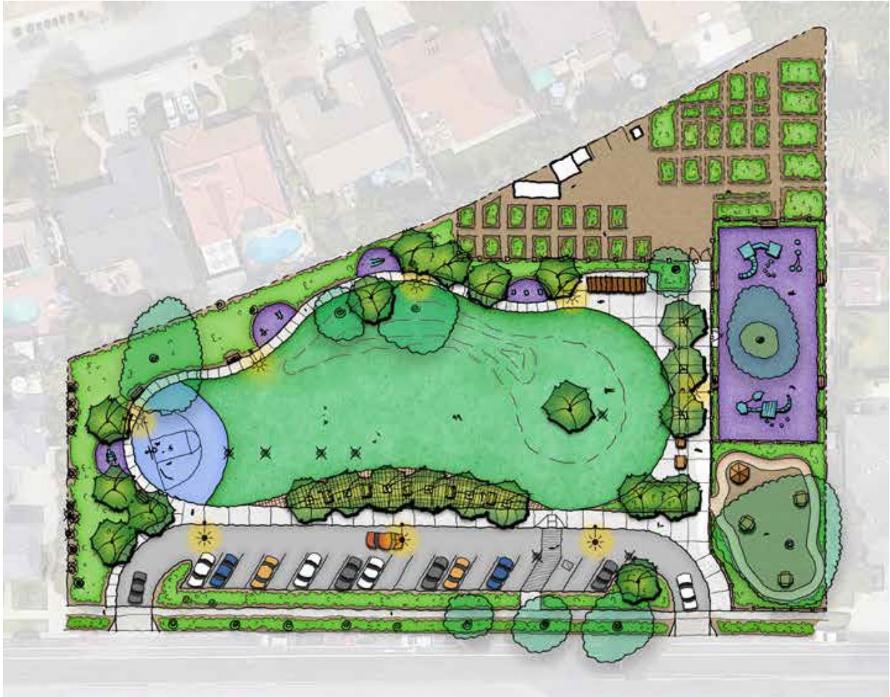
Figure 1: Phase 1 of the Master Plan park layout.