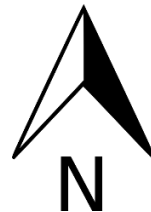
Figure 2: Regional Location Map.