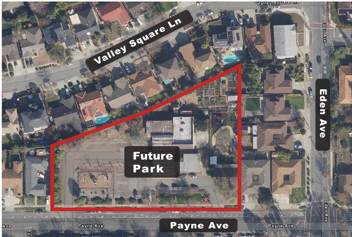
Figure 1: The park location at 3257 Payne Avenue.