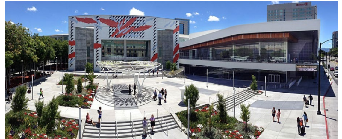
San José McEnery Convention Center