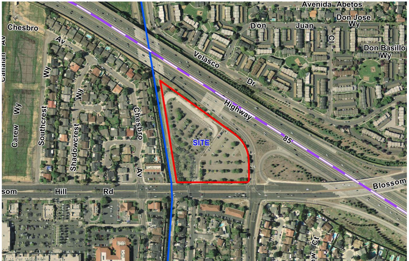
Exhibit A: Vicinity Map/Aerial