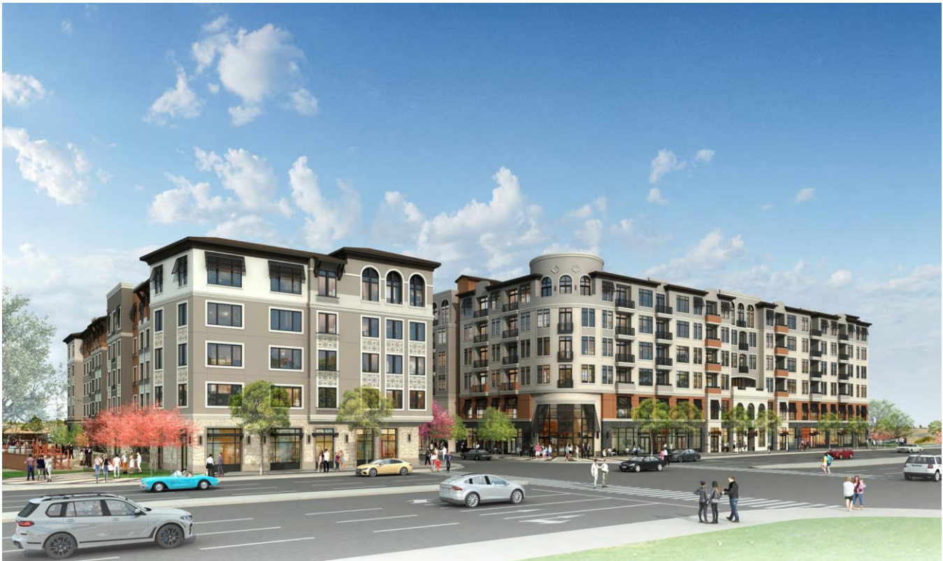
Figure 1 – Project Rendering

Analysis: The windows, window treatments, and architectural projections provided with the project design is consistent with the façade articulation guidelines. There is at least one projection, change in wall plane, or architectural feature that meets this guideline on all facades of the project, as illustrated in the project rendering below.