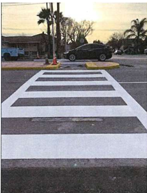
White and Farringdon