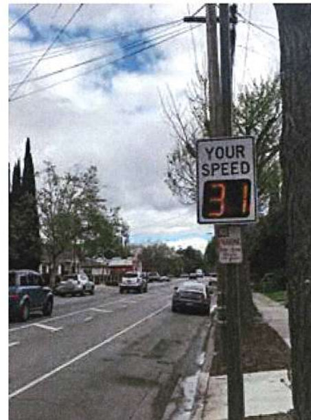
10th and Washington