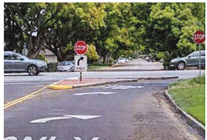
Leigh and Campbell