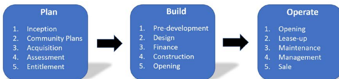
Figure 1: 15 Step Affordable Housing Development Process 6

Developing AH is a complex and lengthy process from project inception to the construction of units ready to be leased by qualified occupants. That process includes land acquisition, project design, zoning and permit approval, financing, and, finally, construction and leasing. Multiple entities are involved, and all project stages take time. The length of the development pipeline, which is the time from project inception to units being ready-to-lease, is 4-5 years. The process steps noted below are simplified. For example, project financing work begins quite early and often changes as the entitlement steps are finalized and the overall scope and design of the plan is completed.