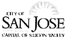
EXHIBIT "A" (File Nos. C15-054; SP16-053; V17-004)