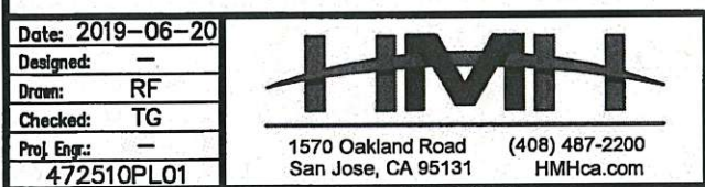
EXHIBIT "B" PLAT TO ACCOMPANY DESCRIPTION: FOR ZONING PURPOSES SAN JOSE CALIFORNIA