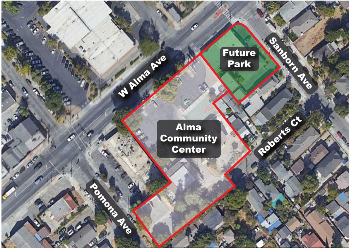
Figure 1: Site Location Map. The park site location at the southwest corner of W. Alma Ave. and Sanborn Ave.