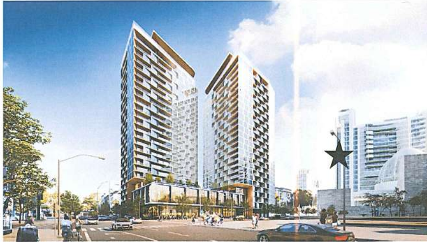
Figure 1 – View from Fourth Street