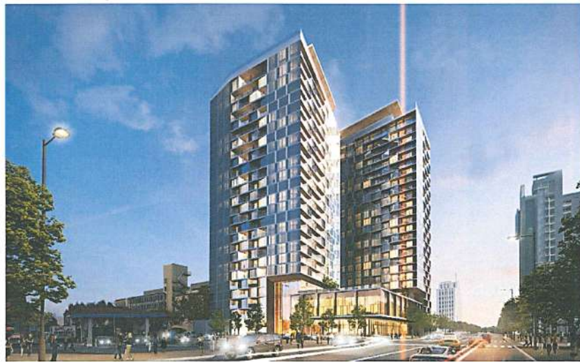
Figure 2 – View down Santa Clara Street