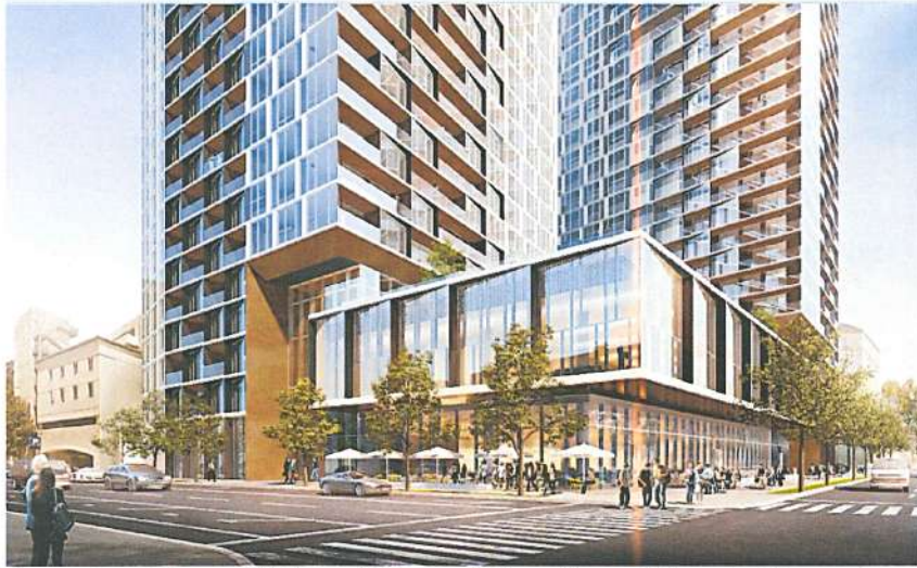
Figure 3 – Ground Floor View at Fourth and Santa Clara streets