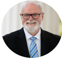
HON. JIM BEALL STATE SENATOR