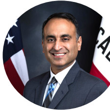
HON. ASH KALRA STATE ASSEMBLYMEMBER