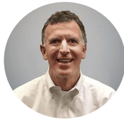
Jeff Arrillaga Urban Community