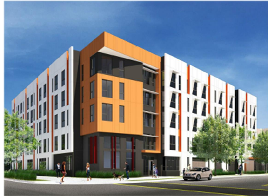
Immanuel Sobrato Apartments 106 affordable homes