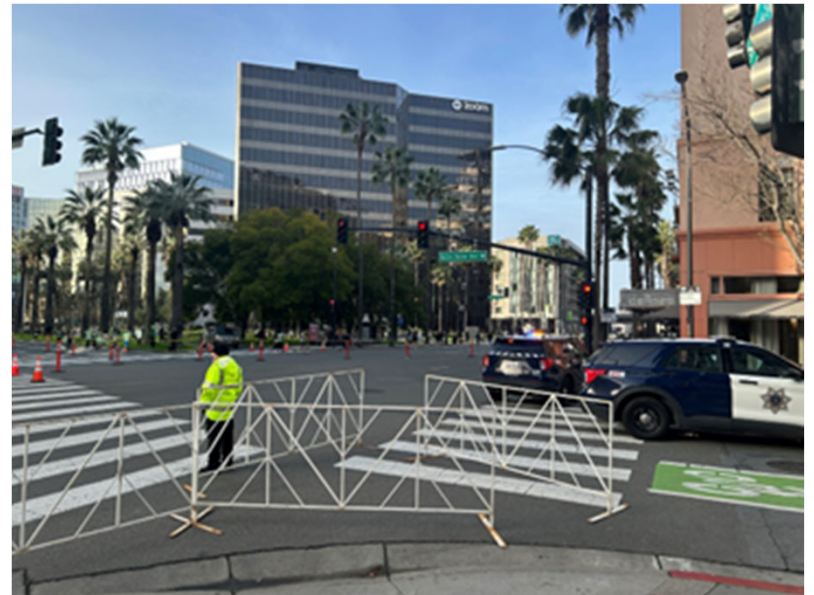
Source: Auditor photo at the 2025 Shamrock Run.