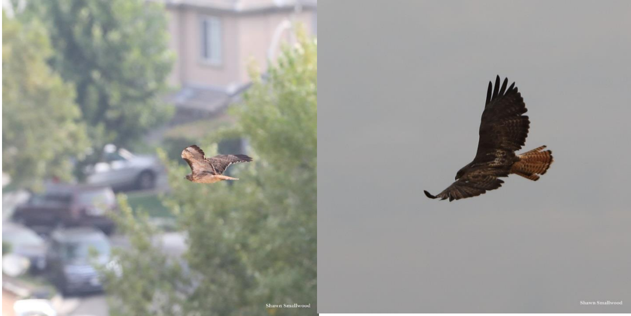
Figure 4. A red-tailed hawk seen against a residential background (left photo) and after having begun soaring (right photo) just northeast of the proposed project site on 25 August 2018. I also saw two red-tailed hawks forage together over the proposed project site, both soaring and kiting.