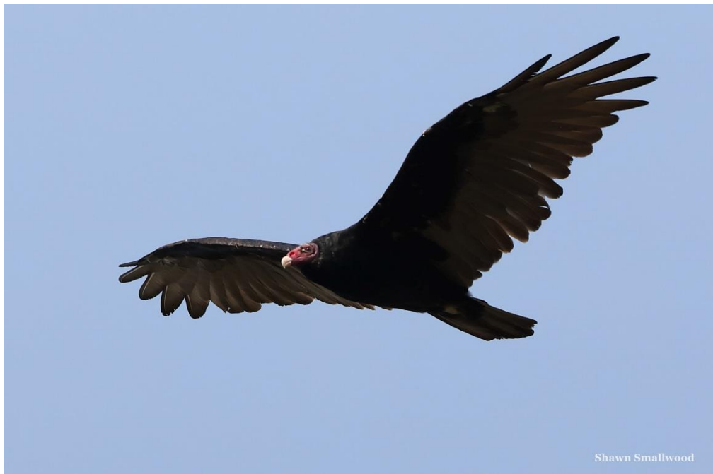
Figure 5. One of multiple turkey vultures foraging over and around the proposed project site on 25 August 2018.