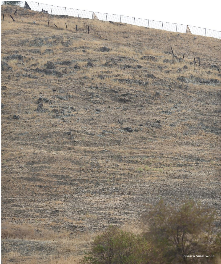
Figure 1. Eastern slope of Dove Hill site, including ground squirrel burrow systems on lower half of the slope. In eastern Alameda County I have many times seen burrowing owls occupy burrows on slopes like this one.