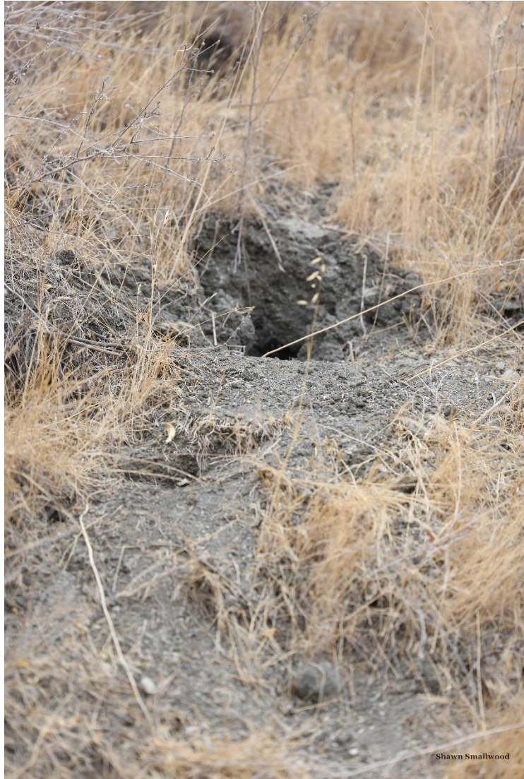
Figure 12. A ground squirrel burrow on the proposed project's border, observed on 25 August 2018. Such burrows are used as breeding and refuge habitat by burrowing owls.