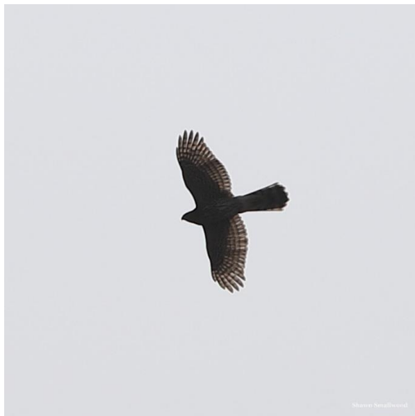
Figure 3. Cooper's hawk having just left the proposed project site, 25 August 2018. I also saw this or another Cooper's hawk at the intersection of Hassler Parkway and Trestlewood Drive and just north of the north end of Thornberry Lane.