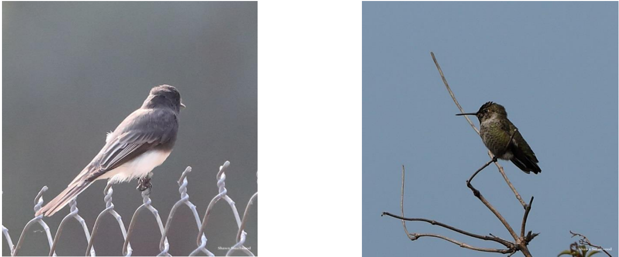
Figure 9. Black phoebe (left) and black-chinned hummingbird (right) near the proposed project site on 25 August 2018.