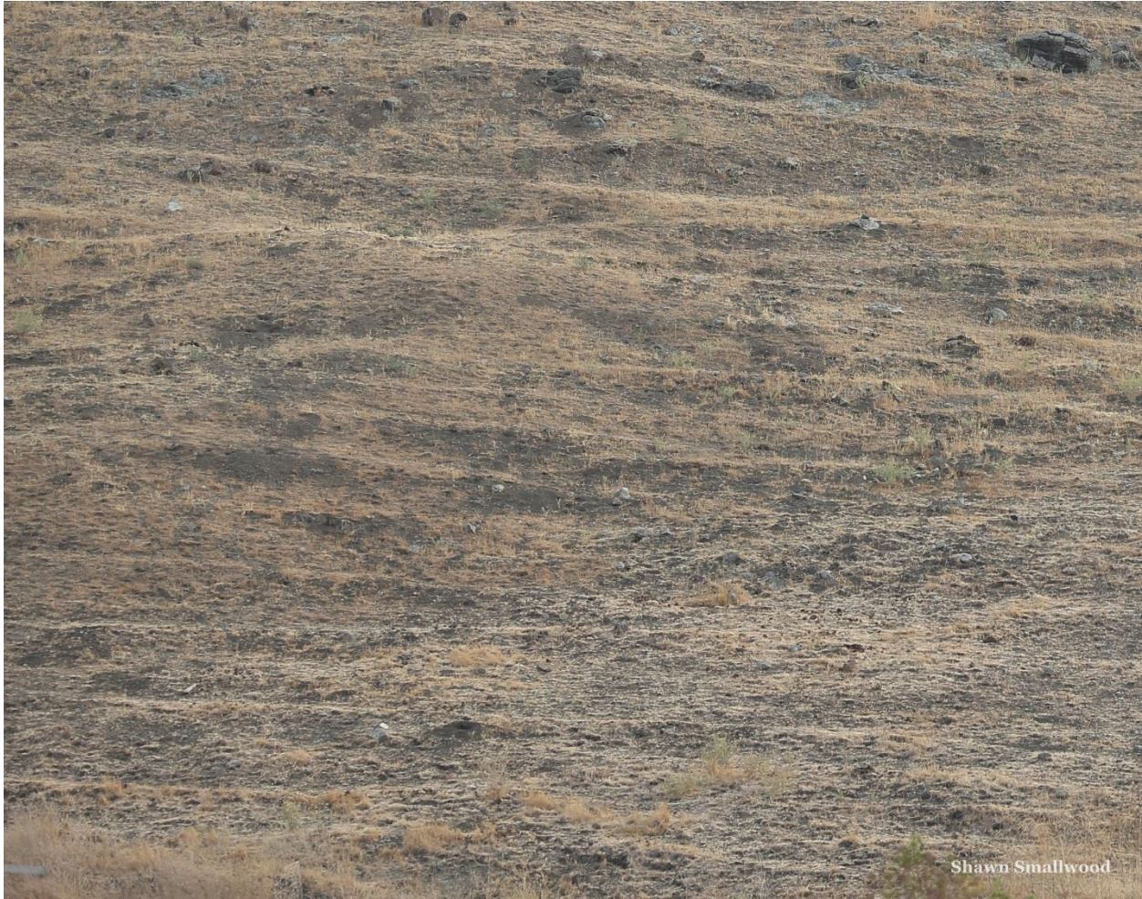
Figure 11. At least 15 ground squirrel burrows are visible in this photo frame on the proposed project site on 25 August 2018, indicating the presence of a key component of burrowing owl habitat.