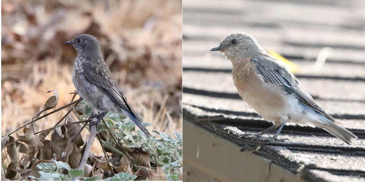
Figure 8. Fledgling western bluebird (left) watched by adult female (right) near the proposed project site on 25 August 2018.