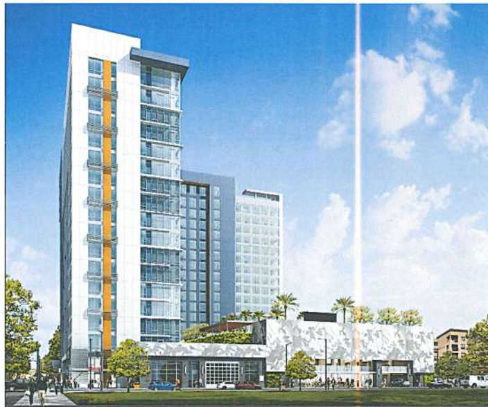
Figure 4 - View from Second Street