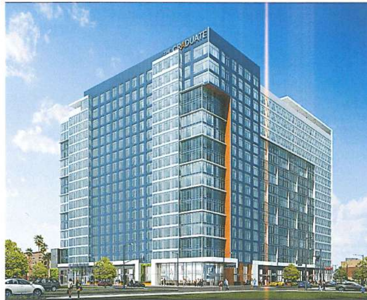
Figure 2 - San Carlos and Third streets