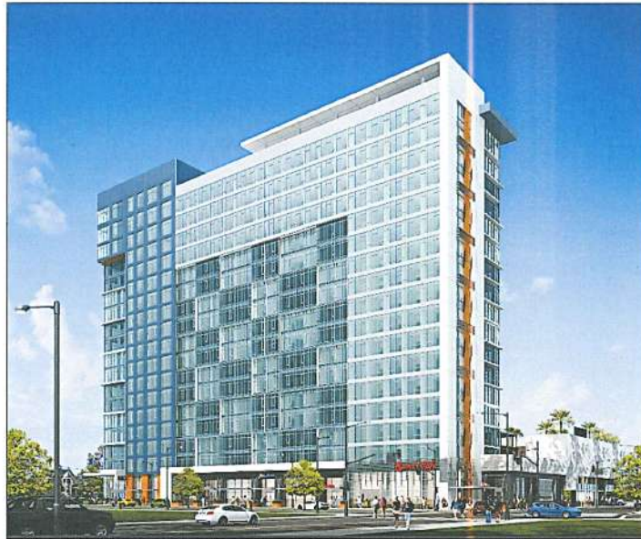
Figure 3 - San Carlos and Second Streets