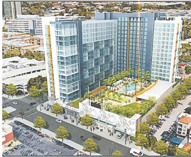
Figure 1 - Aerial View on Second Street