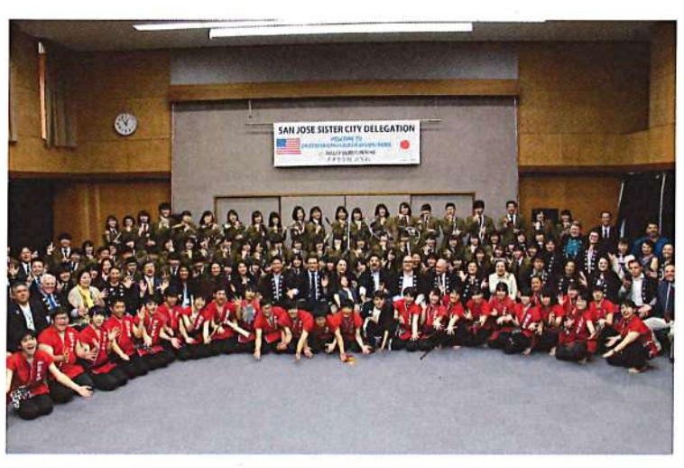
Figure 1: Gakugeikan High School Administration, Brass Band, and Wadaiko Drum Club with Members of San José Okayama Sister Cities Delegation. Okayama, Japan

This year the City of San José and Okayama celebrated 60 years of friendship and understanding through Sister Cities International. This is both Okayama's and San José's oldest partnership and the third oldest within Sister Cities International, yet still one of the strongest.