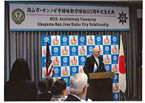
Figure 3: Councilmember Johnny Khamis presenting opening remarks at Okayama City Hall - April 9, 2018

gauntlet of applause from Okayama City employees, we continued to receive the most gracious hospitality and truly heartfelt welcome. That first meeting consisted of welcome remarks from Okayama Mayor Masao Omori, Councilmember Johnny Khamis, Sister Cities International