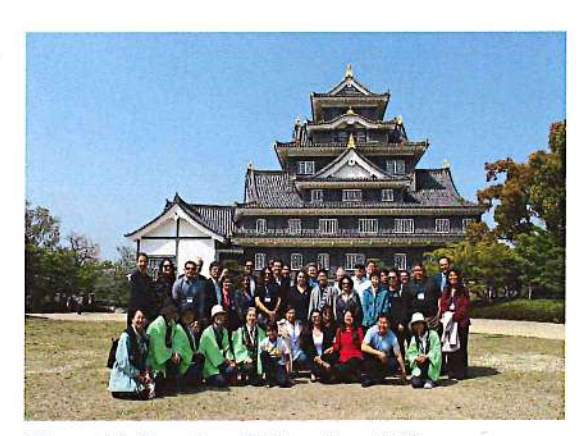
Figure 10: San Jose Delegation at Okayama Castle with volunteer tour guides.

The remainder of the day we were taken on a tour to see three unique highlights in Okayama. We visited the beautiful Okayama Castle and Korakuen Garden where we learned that each of them had to be rebuilt after being destroyed during WWII by American B-52 bombers. We were also provided an opportunity to learn the art of traditional Okayama Bizen Ware pottery and a few of us were even allowed to try on traditional Kimono and Samurai dressings. The local newspaper popped in and even wrote a story the next day featuring members of our delegation in a photo, and although they didn't make the