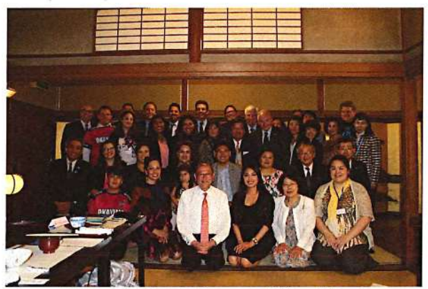
Figure 13: San José and Okayama Sister Cities delegation together at farewell dinner.

I was beyond impressed with not only the hospitality of our hosts and the experiences we shared, but also with the participation and professionalism displayed by everyone from our San José delegation. I felt proud to be part of this delegation and to be together with them representing our City as we continued to build on the important work we set out on 60 years ago.