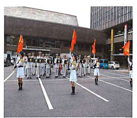
Figure 4: Okayama Fire Department Band Welcome at Okayama City Hall

On Monday, April 9th, we began our visit with a trip to Okayama City Hall for an official meeting and ceremony kicking off the visit. Having been present for a majority of the events we hosted last year, I can say that our reception of the Okayama delegates also pales in comparison to how we